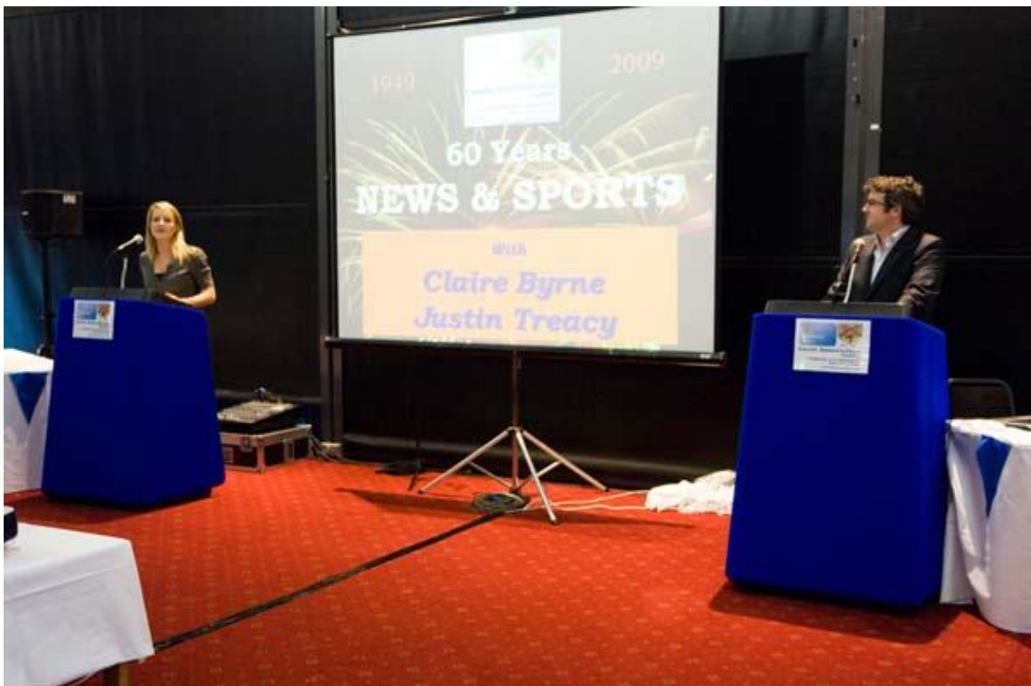
'The Laois Association – Dublin 60 Years News & Sports Bulletins'