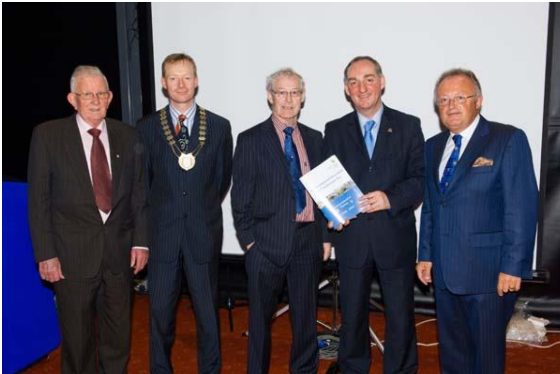
Launching the Commemorative History of the Association.