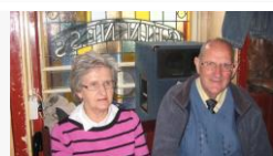
More pictures inside