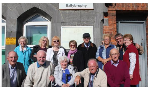
Our October 2016 visit on a historic day in Rathdowney - More inside ...